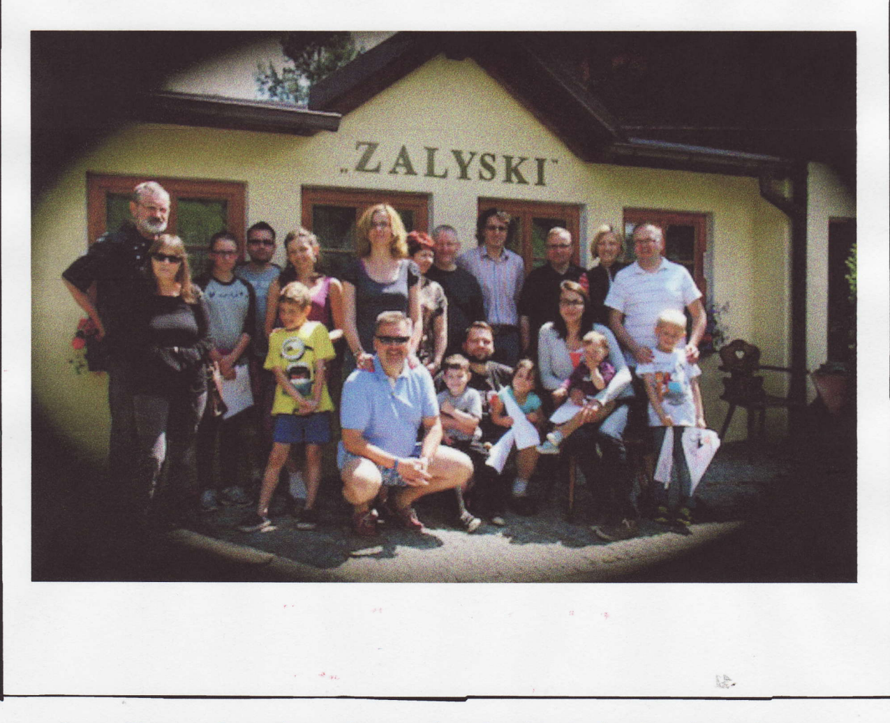
Pastors2Pastors - Strengthening the evangelical church leadership throughout Poland

Thank you so much for making this possible!